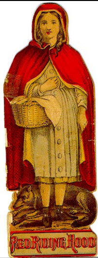
1. Red Riding Hood

Wolf Granny Red Riding Hood The woodcutter